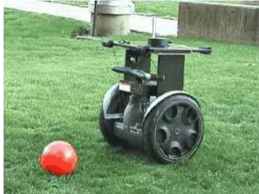
Figure 2. Segway RMP

provided it satisfies the safety constraints and does not increase the physical size beyond the prescribed limits. All robots must be deemed safe by the referee prior to the game (see section 5. Safety and Appendix I. Segway RMP Safety Inspection Checklist ). The following image shows a typical example RMP platform.